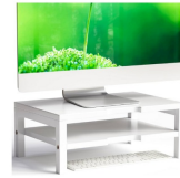
ZHOMUD Monitor Stand Riser