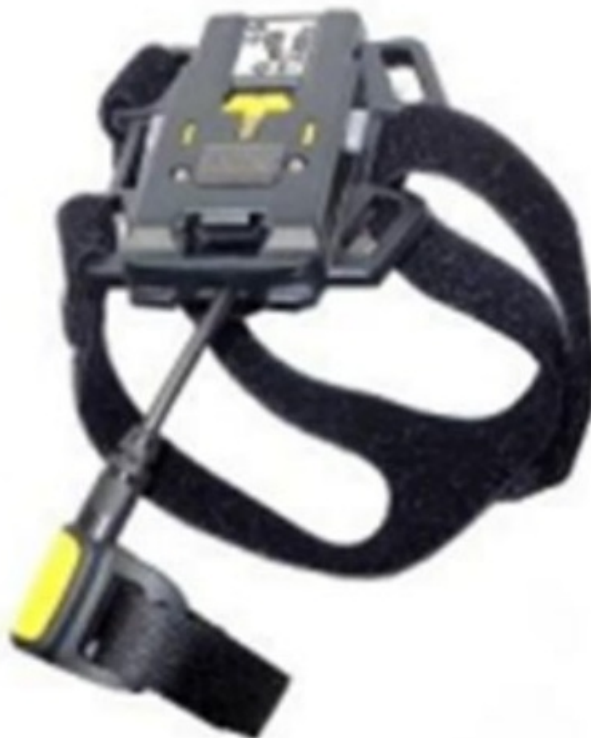
RS5100/RS6100 Back of Hand Mount for Freezer Environments Includes hand strap and small finger strap