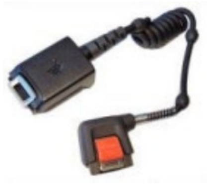
RS5100 / RS6100 Corded Adapter for WT6x