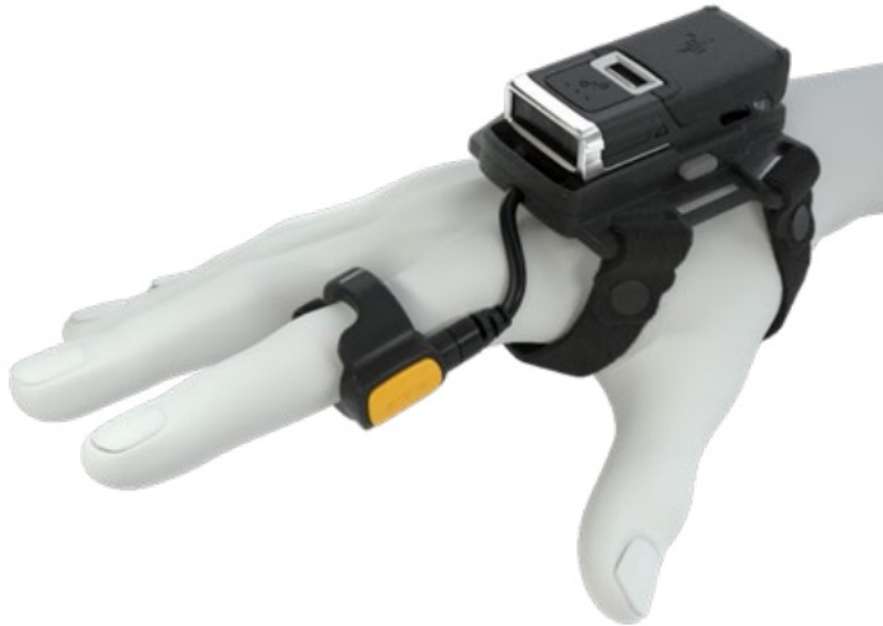
RS5100/RS6100 Back of Hand Mount.