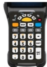
29 Key Function