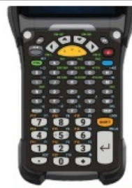
53 Key TE 3270