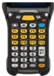
34 Key Function