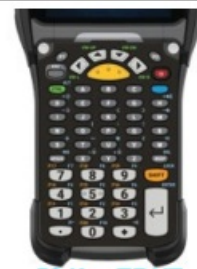
53 Key TE VT