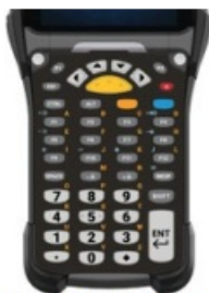
43 Key Function