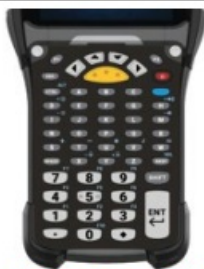
53 Key Standard