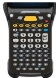
58 Key Func AN