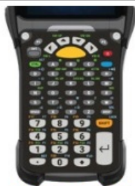
53 Key TE 5250