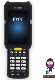
ZEBRA MC330L Mobile Computer