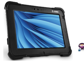
ZEBRA L10 Windows Tablet