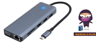
Yishilian TC-1201A 12 in 1 TYPE-C Multi-Function Adapter