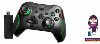
YENKEE YCP 2012 Juicebox Controller