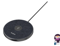
Yealink VCM35 Video Conferencing Microphone Array