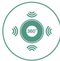
6m-360° voice pickup range