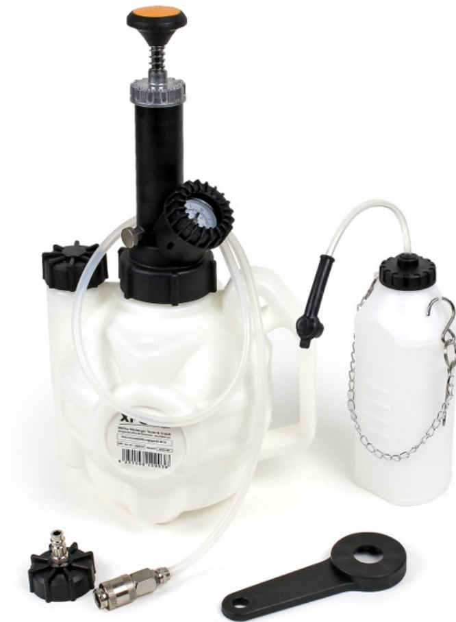
Illustration similarities may vary depending on model

Read and follow the operating instructions and safety information before using it for the first time.