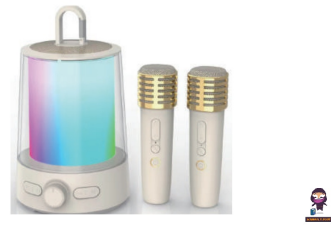
Xiaomi Multi function Camping Lantern with Speaker