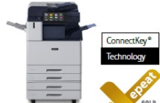
Xerox® AltaLink® C8130/C8135/C8145/ C8155/C8170 Color Multifunction Printer