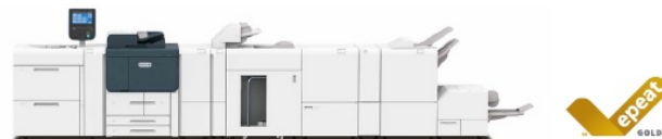
Xerox® PrimeLink® B9100/B9110/B9125/B9136 Copier/Printer Print, Copy, Scan, Email, Fax (optional for B9100)