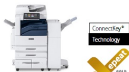
Xerox® EC8036/EC8056 Color Multifunction Printer