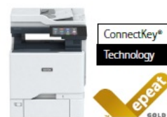
Xerox® VersaLink® C625 Color Multifunction Printer