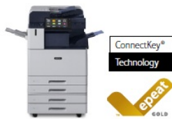
Xerox® AltaLink® B8145/B8155/B8170 Multifunction Printer