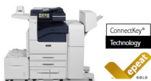
Xerox® VersaLink® B7125/B7130/ B7135 Multifunction Printer