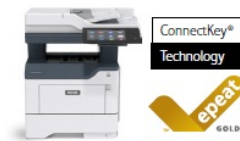
Xerox® VersaLink® B415 Multifunction Printer