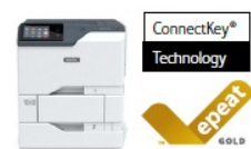
Xerox® VersaLink® C620 Color Printer Print