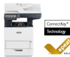
Xerox® VersaLink® B625 Multifunction Printer