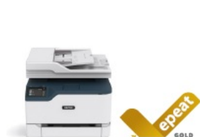
Xerox® C235 Color Multifunction Printer