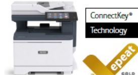
Xerox® VersaLink® C415 Color Multifunction Printer