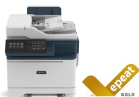
Xerox® C315 Color Multifunction Printer