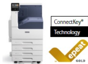
Xerox® VersaLink® C7000 Color Printer Print