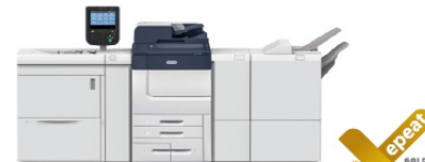
Xerox® PrimeLink® C9065/C9070 Printer Print, Copy, Scan, Email, Fax