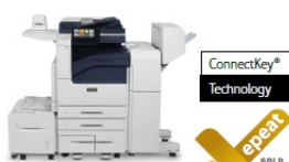
Xerox® VersaLink® C7120/C7125/ C7130 Color Multifunction Printer