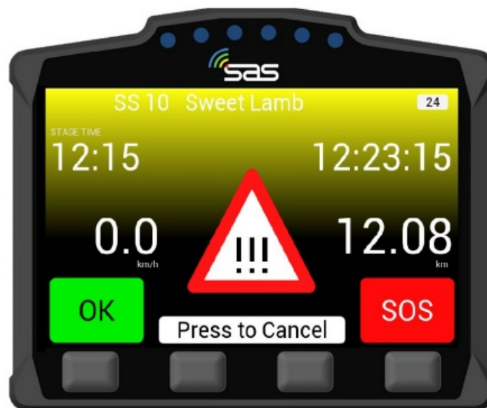
SCREEN 15. Manual Hazard in Transport Mode

SCREEN 15 – If manual hazard is sent in transport mode, this can be upgraded or downgraded the same way as a stage hazard. If the hazard is no longer required, it can also be cancelled by pressing either of the two middle buttons “PRESS TO CANCEL”.