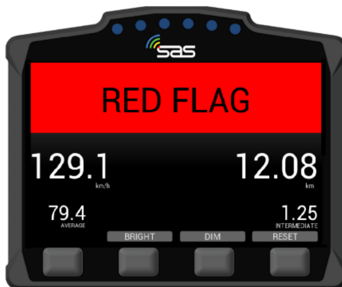
SCREEN 11. RED FLAG in Stage Mode

SCREEN 11 – Once the red flag has been acknowledged, normal stage functions will display with a warning still at the top of the screen.