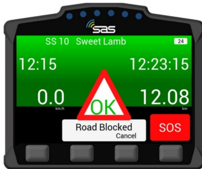
SCREEN 7A. OK – Road Blocked

SCREEN 8 – If the SOS button is pressed, it must be confirmed as either a fire or medical SOS by pressing one of the two middle buttons. It can also be cancelled if pressed by mistake.