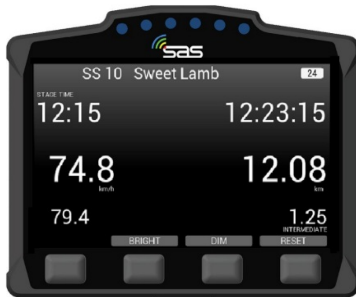
SCREEN 4. Stage mode

SCREEN 5 – If the start is postponed for whatever reason and the start time is cancelled, the unit will display the Transport Screen. Once it is clear to send cars again the official will re-issue a new start time.