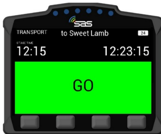
SCREEN 3. Stage Start

Please note this is only a secondary starting method as explained on the previous page.