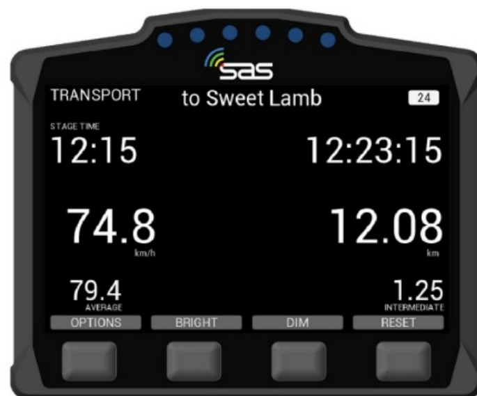
SCREEN 5. Start Time Cancelled

SCREEN 5 – If the start is postponed for whatever reason and the start time is cancelled, the unit will display the Transport Screen. Once it is clear to send cars again the official will re-issue a new start time.