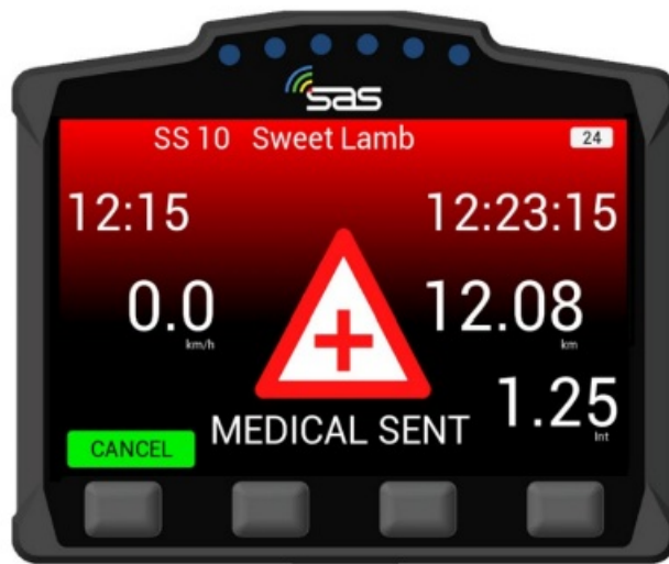
SCREEN 9. Downgrade SOS

SCREEN 9A – If you select the cancel button on the SOS screen, you will be asked to confirm the downgrade. Once confirmed, the device will downgrade to an OK status.