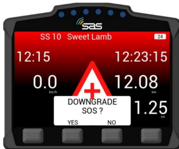
SCREEN 9A. Downgrade SOS

SCREEN 9A – If you select the cancel button on the SOS screen, you will be asked to confirm the downgrade. Once confirmed, the device will downgrade to an OK status.