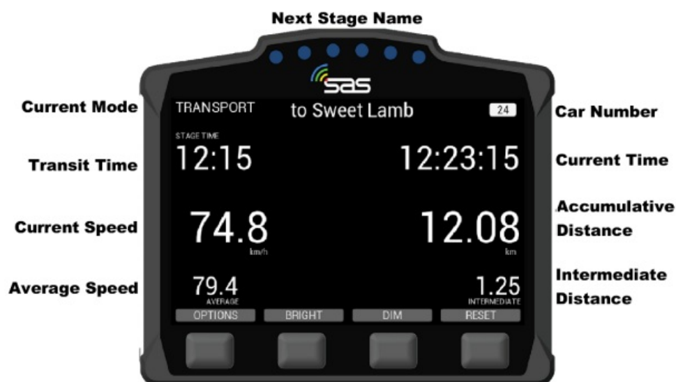
SCREEN 1. Transport Mode