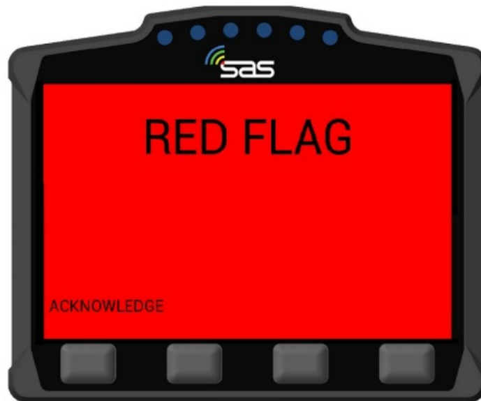
SCREEN 10. RED FLAG Acknowledge

SCREEN 11 – Once the red flag has been acknowledged, normal stage functions will display with a warning still at the top of the screen.