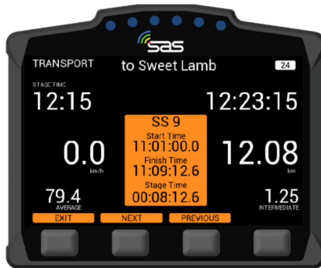
SCREEN 14. Times of completed stages