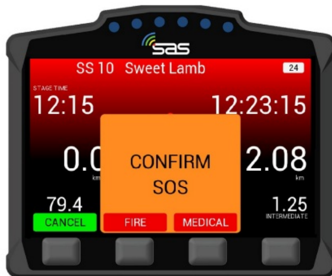
SCREEN 8. Confirm Fire SOS or Medical SOS

SCREEN 8 – If the SOS button is pressed, it must be confirmed as either a fire or medical SOS by pressing one of the two middle buttons. It can also be cancelled if pressed by mistake.