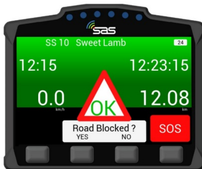
SCREEN 7. OK Acknowledgment

SCREEN 7 – If you select OK after the HAZARD alert, then the following screen will appear, showing that you and the car are OK. The Road Blocked prompt will appear below, select Yes if the vehicle is blocking the road, if the road is clear select NO.