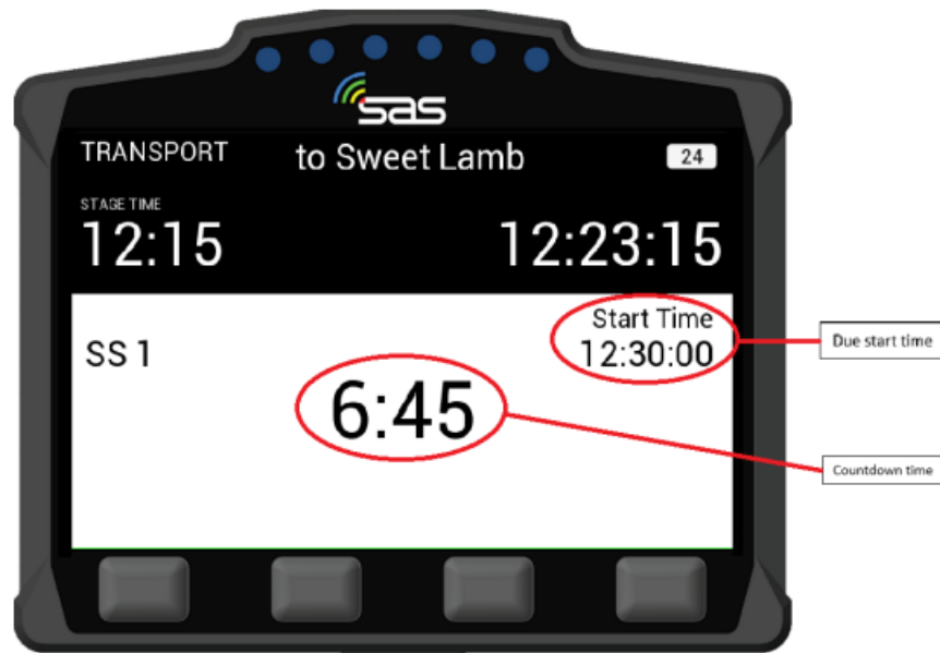
SCREEN 2. Countdown to Stage Start

Important – The countdown on the Start Clock on the side of the start line shall remain as the official starting device, the countdown on the tracking unit shall only be used as the official start time when advised by the start marshal.