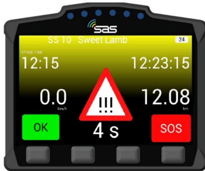
SCREEN 6. HAZARD Notification

SCREEN 7 – If you select OK after the HAZARD alert, then the following screen will appear, showing that you and the car are OK. The Road Blocked prompt will appear below, select Yes if the vehicle is blocking the road, if the road is clear select NO.