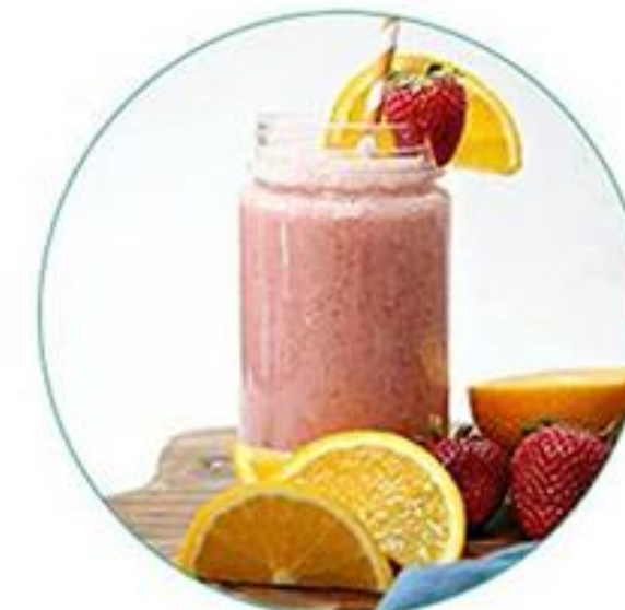
Smoothies & Milk Shake