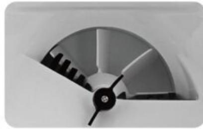
● The large