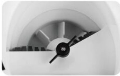
● The small