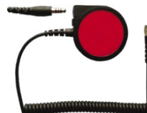
WPWLP-X10 Large In-Line PTT -for Peltor J11 Headset