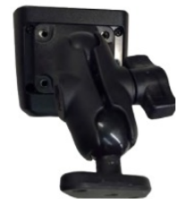
XMDM2 Mobile charger mounting arm