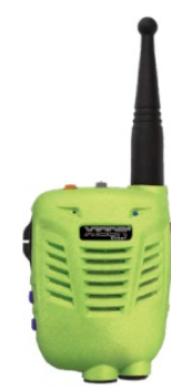
XCFC Custom Front Cover option