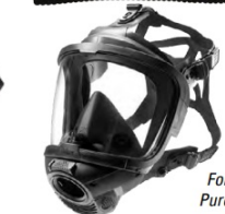
WPWLP-X10D Large In-Line PTT -for Draeger Breath .App.