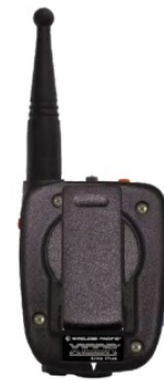
XNMC Non-metal rotary shoulder mount clip