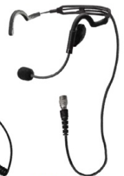
WPHFH-X10 Headset Industrial lightweight