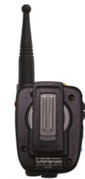
XLMC Standard long rotary shoulder mount clip