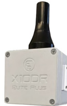
X10DR Elite Plus Rooftop Gateway