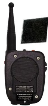
XVMC Velcro® shoulder mount option includes Velcro patch - for best shoulder placement