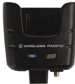
X10DR Elite Plus Standard Gateway