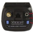
X10W Option 10 Watt speaker jack USB programming port PA/In-Car volume control 10W RMS IP65 Speaker