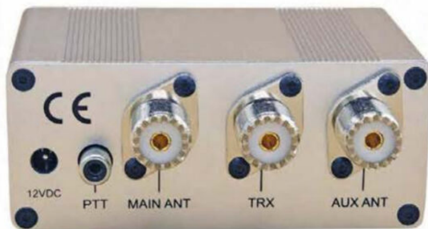
Figure 8 — QRM Eliminator rear panel.

The included instruction sheet briefly discusses the antenna functions and notes that the second antenna should be far enough from the main one that it does not pick up enough signal when transmitting to damage the ORM Eliminator. The second antenna must be stationary for the noise to null out properly, because the relative amplitude and phase coming from both antennas should stay constant, or else the controls will need to be readjusted. Even so, a stationary truck, for example, could produce noise that can be nulled out, but if it is moving, the noise will not null as well at the same settings. It is also possible that rigidly mounted antennas can pick up noise that can be nulled, but noise picked up by an antenna swinging wildly in the wind might not.