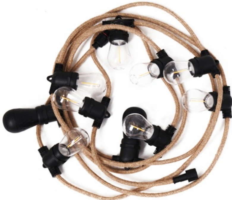
S14 string light with speaker Instruction Manual