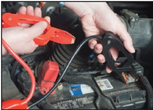
Attach Black (-), Then Red (+)