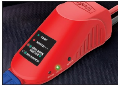
When You Have SOLID GREEN LIGHT On Your Smart Box, Start Your Engine