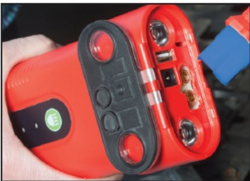
Once it Starts, Disconnect Clamps from Weego 70