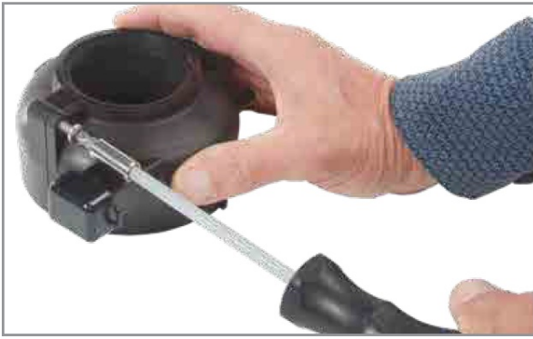
1. Remove the bolts from the flood sensor.