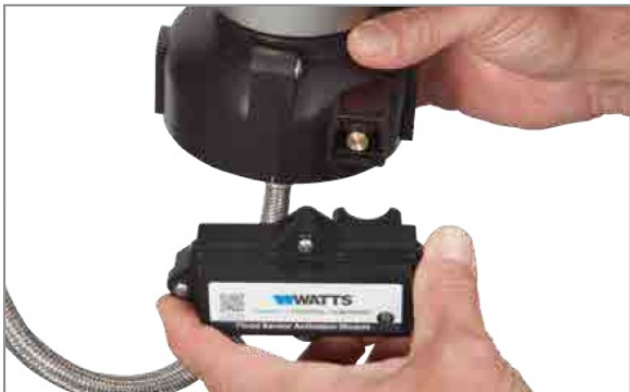
5. Press the activation module onto the sensor.