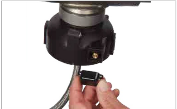
4. Remove the dust cover from the sensor.