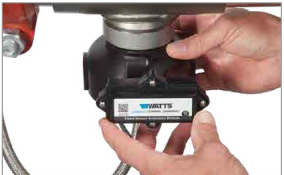
6. Check that the module is fully seated to seal the O-ring and to make electrical contact.

NOTICE Retain the dust cover to protect the flood sensor when the activation module needs to be removed or replaced.