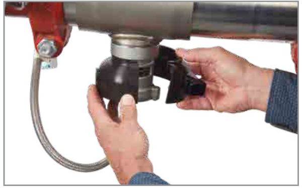
2. Position the two halves of the sensor on the relief valve.