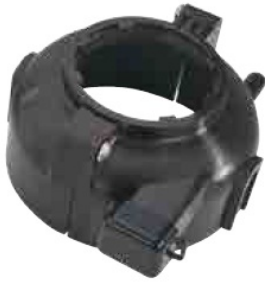
Flood sensor with mounting bolts