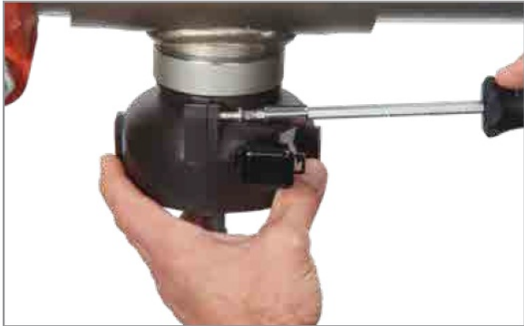
3. Insert the bolts and tighten.