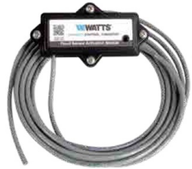
Activation module with an 8' 4-conductor cable