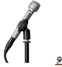
WARM WA-19 Dynamic Studio Microphone