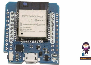
Walfront ESP32 WiFi and Bluetooth Internet of Things Module