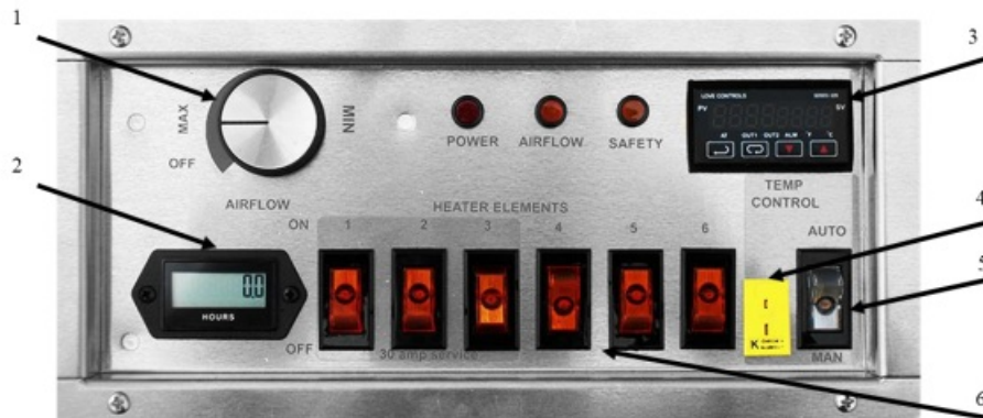
Figure 1. Vulcan Control Panel