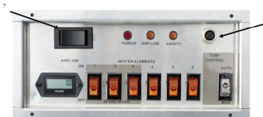
Figure 2. Vulcan RT Control Panel