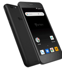
Vortex Volt Mobile Phone