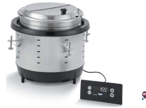
VOLLRATH 74703D Drop In Induction Retherm