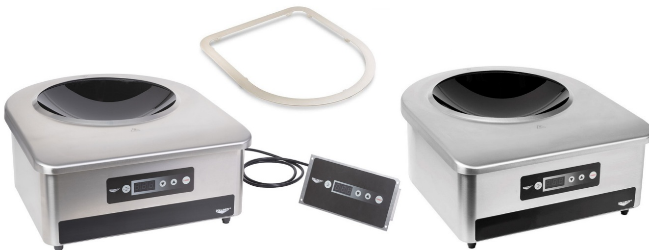
Drop-In Model shown with accessory kit - purchase separately.