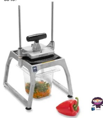
VOLLRATH 55457 InstaCut™ Manual Food Processor