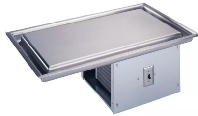
VOLLRATH 36419 Drop In Frost Top