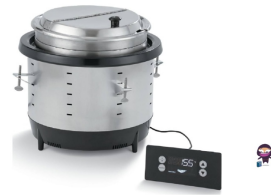
VOLLRATH 26237-1 Drop In Induction Retherm