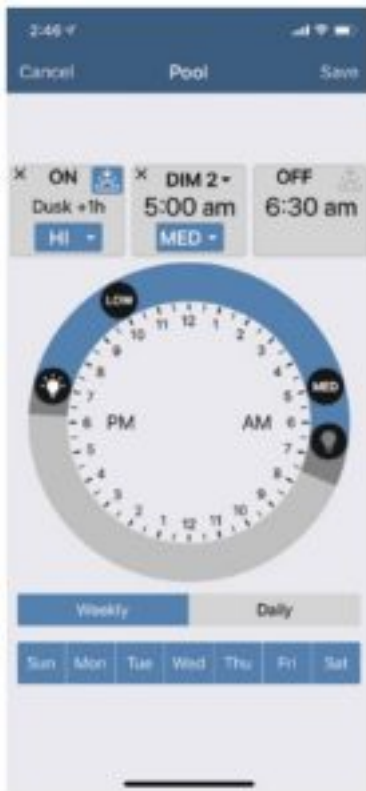
Vista Cloud Scheduling Screen