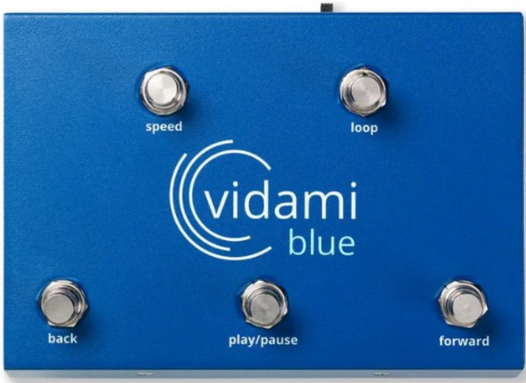
STUDIO ONE MODE & FUNCTIONS GUIDE (PC)