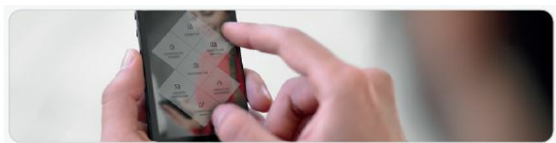
Photo and video control from your smartphone or tablet: take pictures with your Photo Detector and view video from the Cloud cam Pro. Power failure notification: we send you an alert if we detect power failure in your property. Modify action plans and passwords. Modify your codewords or action plan easily.