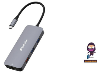
Verbatim CMH-09 USB C Pro Multiport Hub