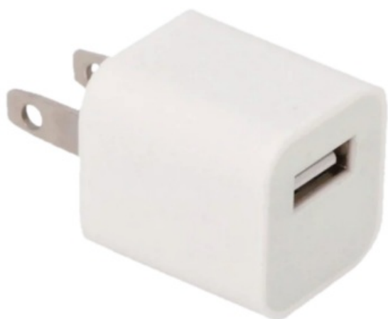
USB-A WALL ADAPTER EXAMPLE (not included)