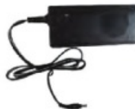
20 Battery Charger