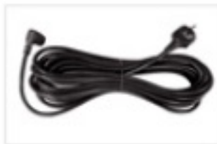
18. Power Cable