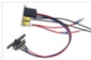
7. PCB-Switch Assy