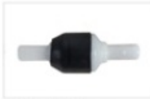
8. Check Valve