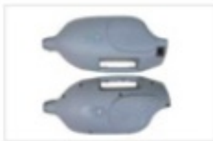
11. Body-R, L