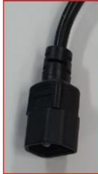
TE11 - C14

If the input is connected to a UPS, you can connect 1 large PSU or 2 small PSU to 1 UPS of 650VA.