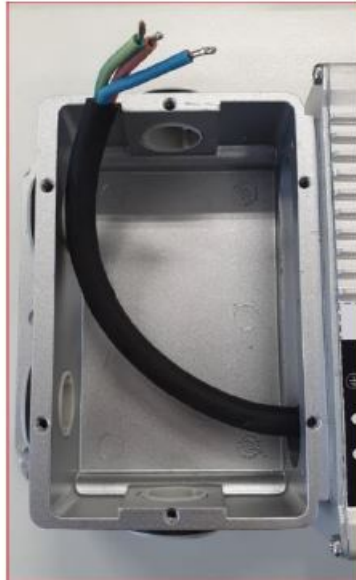
TE10 - JunctionBox

The side marked with INPUT shall be connected to the mains wall outlet (90-305 VAC 50-60 Hz). The TE10 versions are provided with a JunctionBox and are for the USA & Canadian market, where the locker bank is at a Fixed location, for example in a Wall. These TE10 Power supplies shall be installed by a qualified and experienced technician.. An all-pole mains switch in accordance with UL62368-1 Annex L shall be incorporated in the electrical installation of the building. The TE11 and the HEP versions are provided with a C14 connector and are for all other cases, e.g. lockers put in front of a wall or at the end of desks. Those lockers are also often replaced by customers.