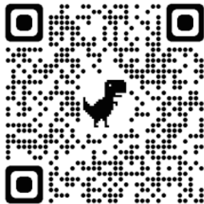
German installation video