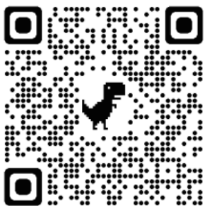
English installation video

Please watch the below video on YouTube to help you install the system. (Or please contact us to get the video link directly) You can scan the code with app or directly with camera