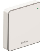
uponor R-208 Smatrix Interface Pulse