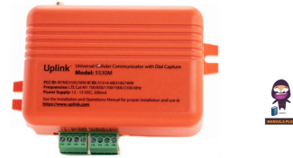
Uplink 5530M Universal Dual Sim Alarm Communicator With Dial Capture