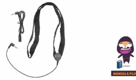
Univox NL-100 Neck Loop