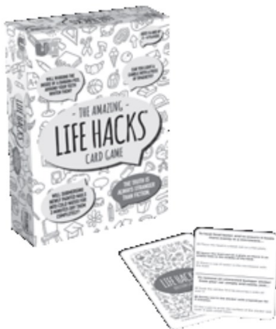
Life Hacks™ Ages 16+