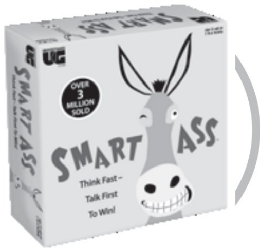
Smart Ass® Ages 12+