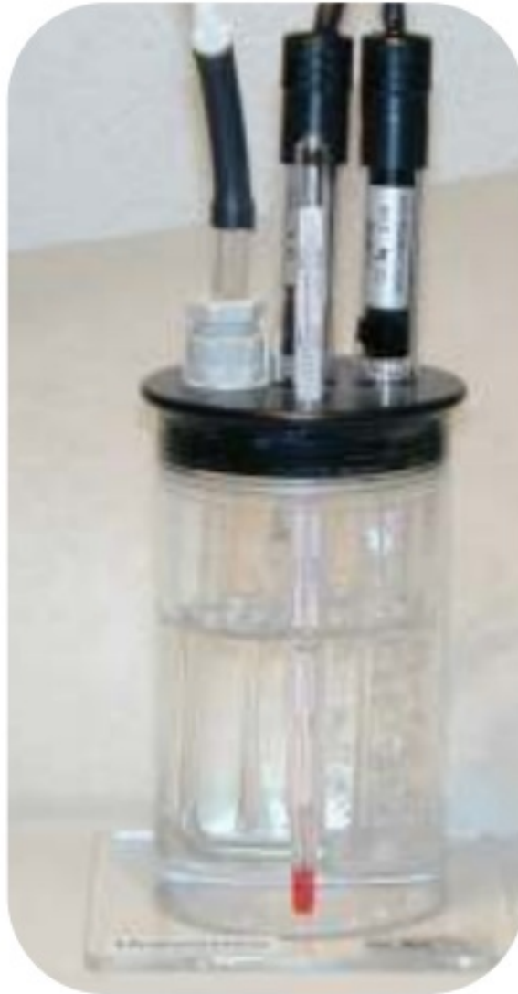
CAL300 with microsensors and bubbling with air.