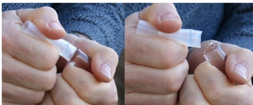
Figure 2: Open the ampoule. Leave the tubing on for protection.