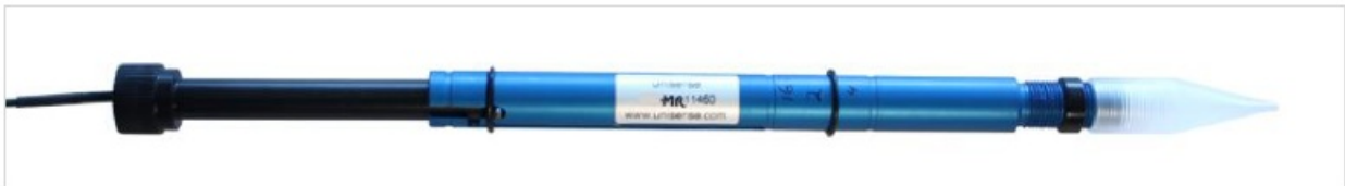
Figure 3: Microsensor mounted in the Microrespiration guide.