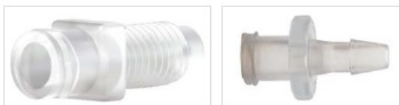
Figure 4: Left: Luer adaptor for direct mounting in the flow cell (e.g., IDEX P-624). Right: Barbed Luer adaptor for tube connection