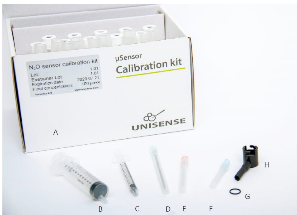
Figure 1: Calibration kit contents: A: Calibration kit box with Exetainers and ampoules, B: 10 ml syringe, C: 1 ml syringe, D: 80 x 2.1 mm needle (green), E: 50 x 1.2 mm needle (red), F: 30 x 0.6 mm needle (blue), G: O-ring, H: Calibration Cap with tubing.