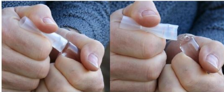
Figure 1: Open the ampoule. Leave the tubing on for protection.