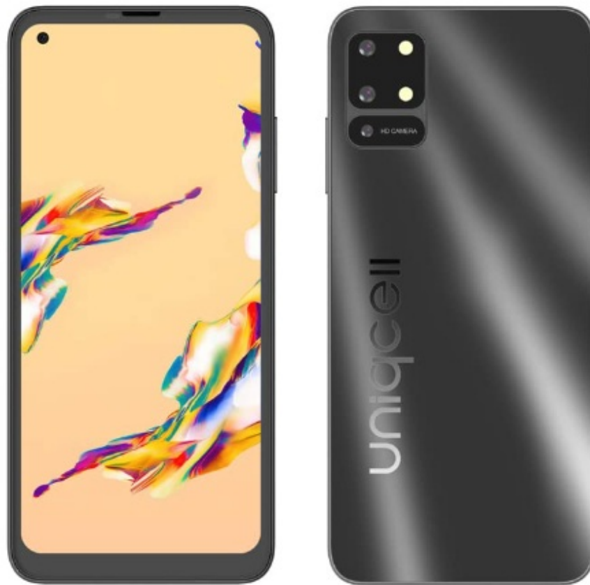
UNI X Overview