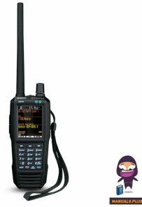
Uniden USDS100 Digital Programmable True