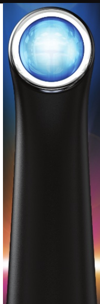
LED Curing Light