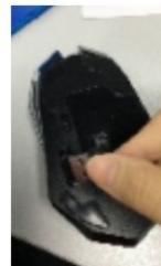
Take out the receiver