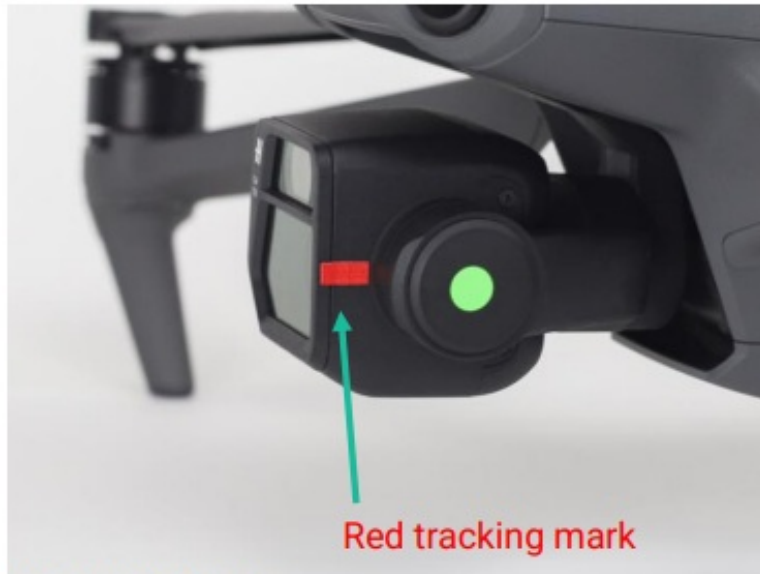
DJI Mavic 3 Camera

Green tracking mark (mount to the center of the circle)