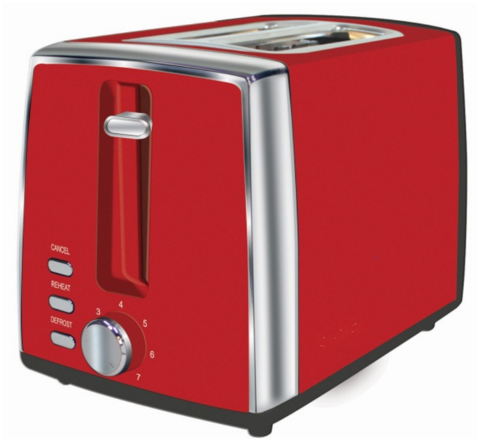
2 SLICE TOASTER MODEL: TS 815